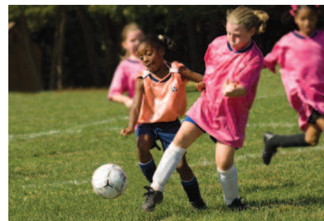
Many communities use recycled water to irrigate parks and playgrounds.

Through nature’s cycles, all water on Earth is recycled water. But, typically, when we hear the term “recycled water” it means wastewater that is sent from our home or business through a pipeline system to a treatment facility where it is treated to a level consistent with its intended use or disposal method. It is then routed directly to a recycled water system for uses such as irrigation or industrial cooling.